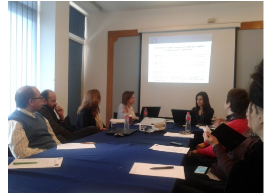
Trainings for potential beneficiaries from Bulgarian municipalities, Sofia, Bulgaria