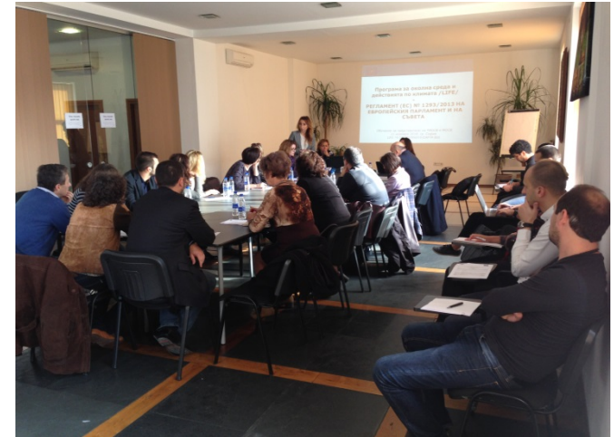
Trainings for potential beneficiaries from business sector, Sofia, Bulgaria