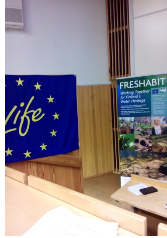
Participation of 2 NCP experts in the LIFE platform for Integrated projects, Helsinki, Finland