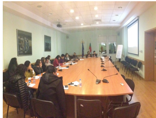
12 experts from RCP and 6 from NCP, Sofia, Bulgaria