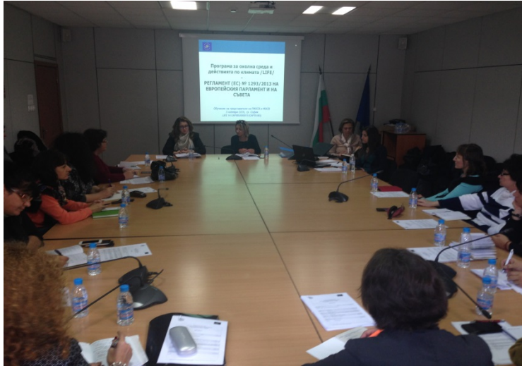
Trainings for the RCP and the NCP, Sofia, Bulgaria